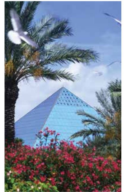
CLOCKWISE FROM LEFT A historic photo of Hotel Galvez and the Seawall; the Grand 1894 Opera House; one of the pyramids at Moody Gardens; thrill rides at Galveston Island Historic Pleasure Pier