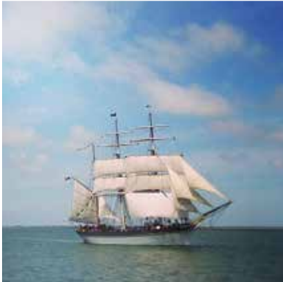
CLOCKWISE FROM LEFT The 1877 tall ship Elissa ; the exterior of the Tremont House hotel; Daiquiri Time Out's Aviation cocktail; the sign outside of Old Moon Deli & Pies