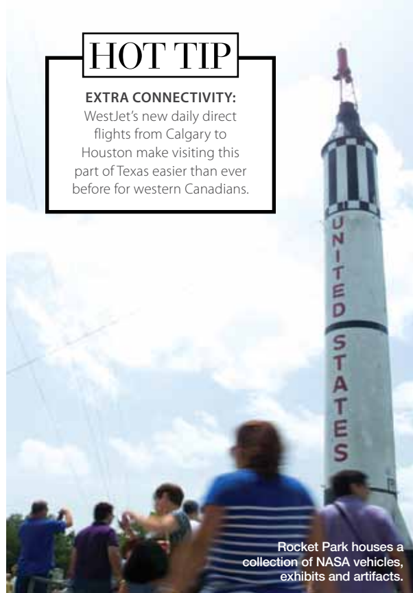
Rocket Park houses a collection of NASA vehicles, exhibits and artifacts.

WestJet's new daily direct flights from Calgary to Houston make visiting this part of Texas easier than ever before for western Canadians.