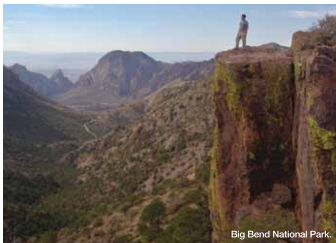
Big Bend National Park.