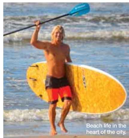
Beach life in the heart of the city.