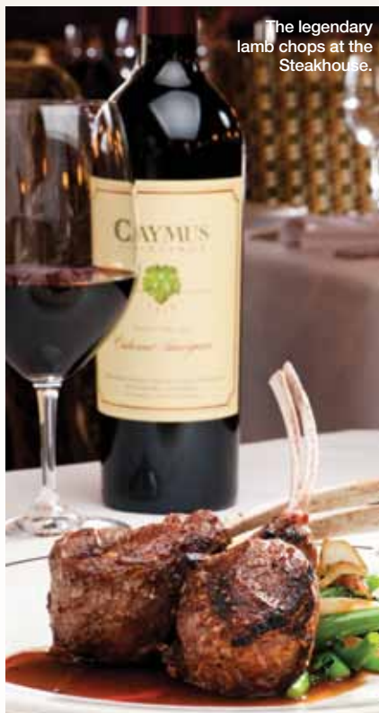
The legendary lamb chops at the Steakhouse.