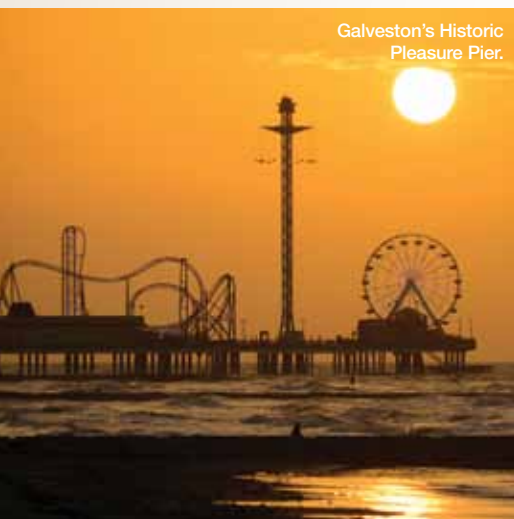
Galveston's Historic Pleasure Pier.