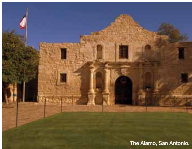
The Alamo, San Antonio.

10. Clients in Dallas can stretch their battered Canadian dollar by buying a Dallas CityPASS, a single ticket that bundles discounted admissions to four of the city's top attractions. They cost just US$44 for adults and US$30 for children. *