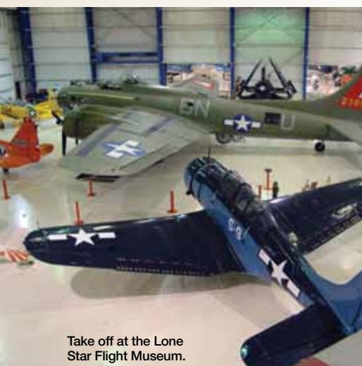
Take off at the Lone Star Flight Museum.