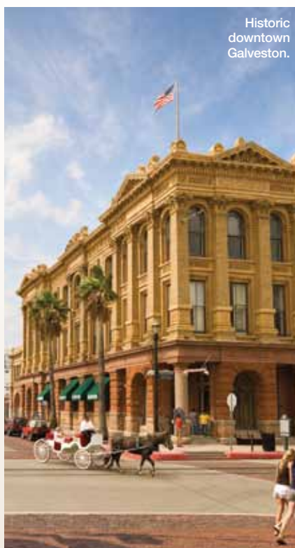
Historic downtown Galveston.