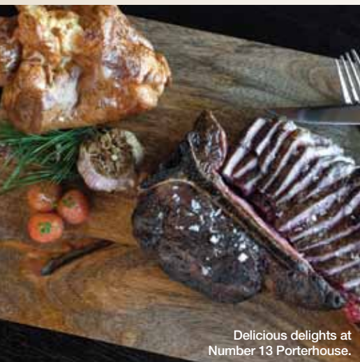
Delicious delights at Number 13 Porterhouse.

A Bachelorette-inspired itinerary for all of those romantic clients out there