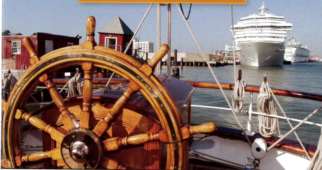
Galveston Island Convention & Visitors Bureau