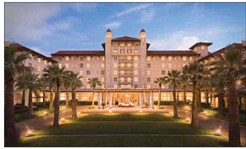
The century-old Hotel Galvez, called the Queen of the Gulf, faces the seawall and ocean beyond.

see the sculptures from aboard the funky Cool Tours painted bus that treks all over the East End, past the mansions on Broadway Avenue and around the Silk Stocking National Historic District. There's a number of guided ghost walks and cemetery tours around town, too. Check out Artist Boat Kayak Adventures to paddle away a morning in Galveston Bay's lagoons and bayous and learn about the local ecosystems.