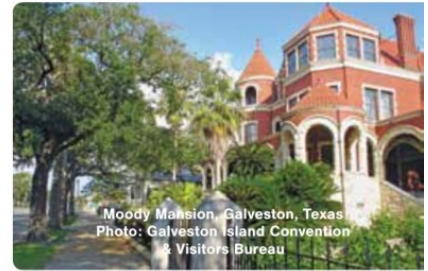
Moody Mansion, Galveston, Texas.