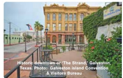
Historic downtown or 'The Strand,' Galveston, Texas.