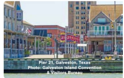
Pier 21, Galveston, Texas.