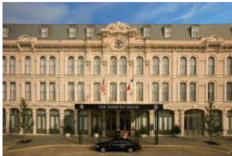
MITCHELL HISTORIC PROPERTIES

The Museum is part of the Galveston Historical Foundation and offers the event-capable 1877 tall ship ELISSA , harbor