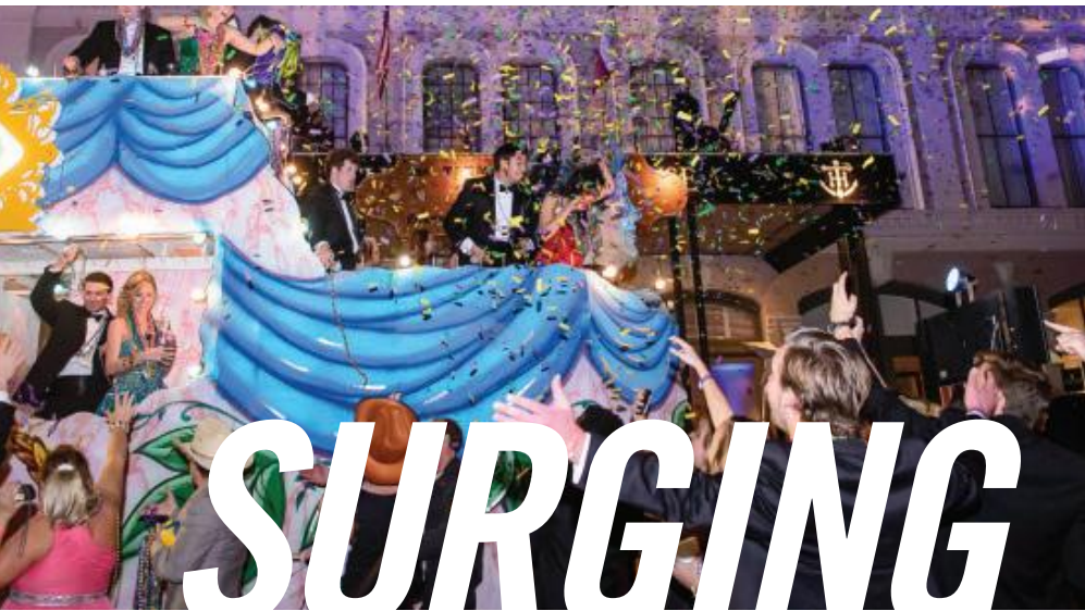
MITCHELL HISTORIC PROPERTIES