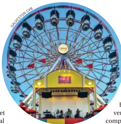
PLEASURE PIER FERRIS WHEEL

gem is the luxurious 224-room Hotel Galvez & Spa, the "Queen of the Gulf." Built in 1911, this Wyndham Grand property offers a full complement of flexible indoor and outdoor venues. Scheduled for completion next month, the