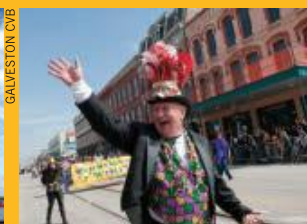
MARDI GRAS! GALVESTON