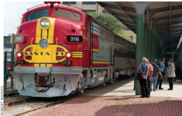
LEFT: MARDI GRAS AT THE TREMONT HOUSE; ABOVE: GALVESTON RAILROAD MUSEUM; BELOW: SEAWALL 1900 STORM MEMORIAL