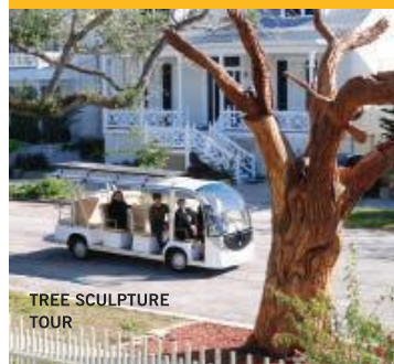
TREE SCULPTURE TOUR