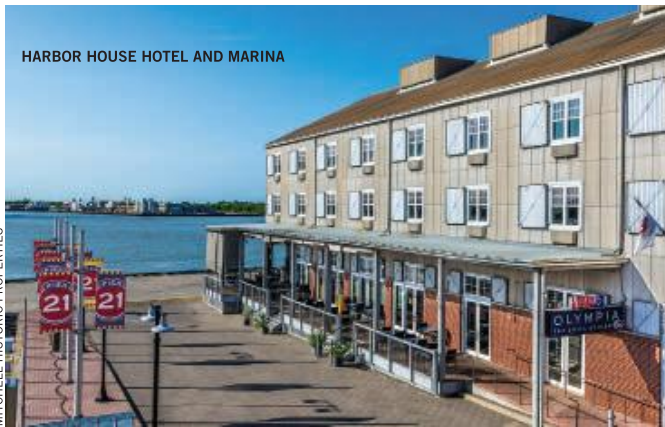
HARBOR HOUSE HOTEL AND MARINA