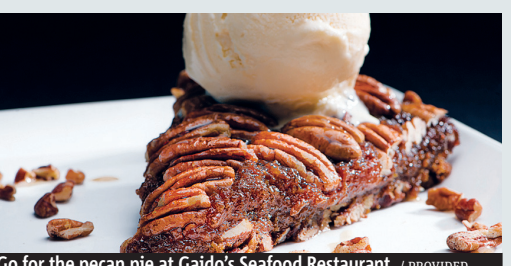
Go for the pecan pie at Gaido's Seafood Restaurant. /

Standing out from the generally beach-centric, relaxed atmosphere of the island is this new establishment, which, with its attention to ingredient acquisition and the upscale atmosphere, would feel at home along some taxiriddled big-city avenue - if it weren't attached to a marina. This isn't a place to take the kids, but it does spectacular things with such sundries as cocktails and gnocchi, and this place knows steak.