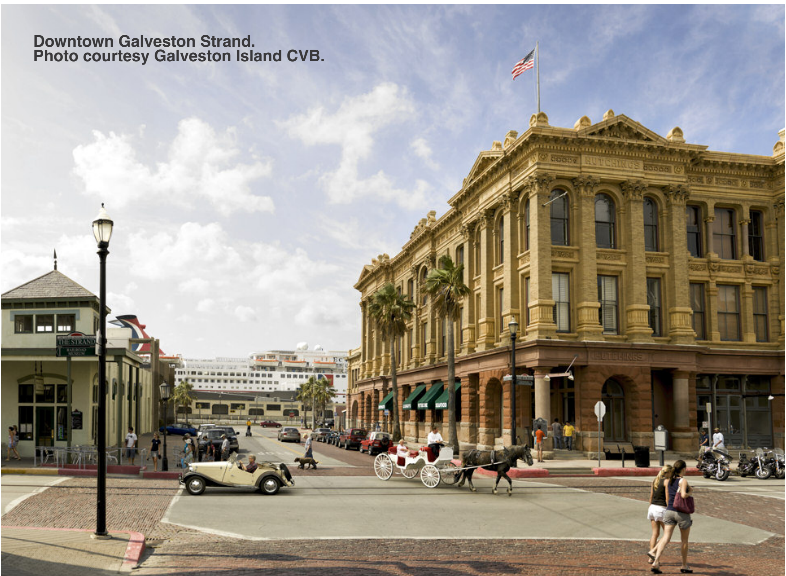
Downtown Galveston Strand.

G alveston Island is a historic beach town located on the Gulf of Mexico just 50 miles from Houston. The island is best known as a vacation destination, offering 32 miles of beaches, a variety of family attractions, Texas' premier cruise port and one of the largest and well-preserved concentrations of Victorian architecture in the country, including several National Historic Landmarks.