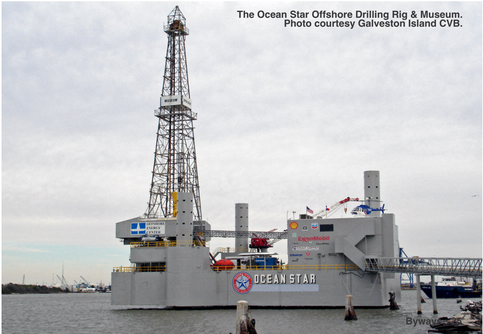
The Ocean Star Offshore Drilling Rig & Museum.

Today, "the Strand" is generally used to refer to the entire five-block business district between 20th and 25th streets in downtown Galveston, very close to the city's wharf.