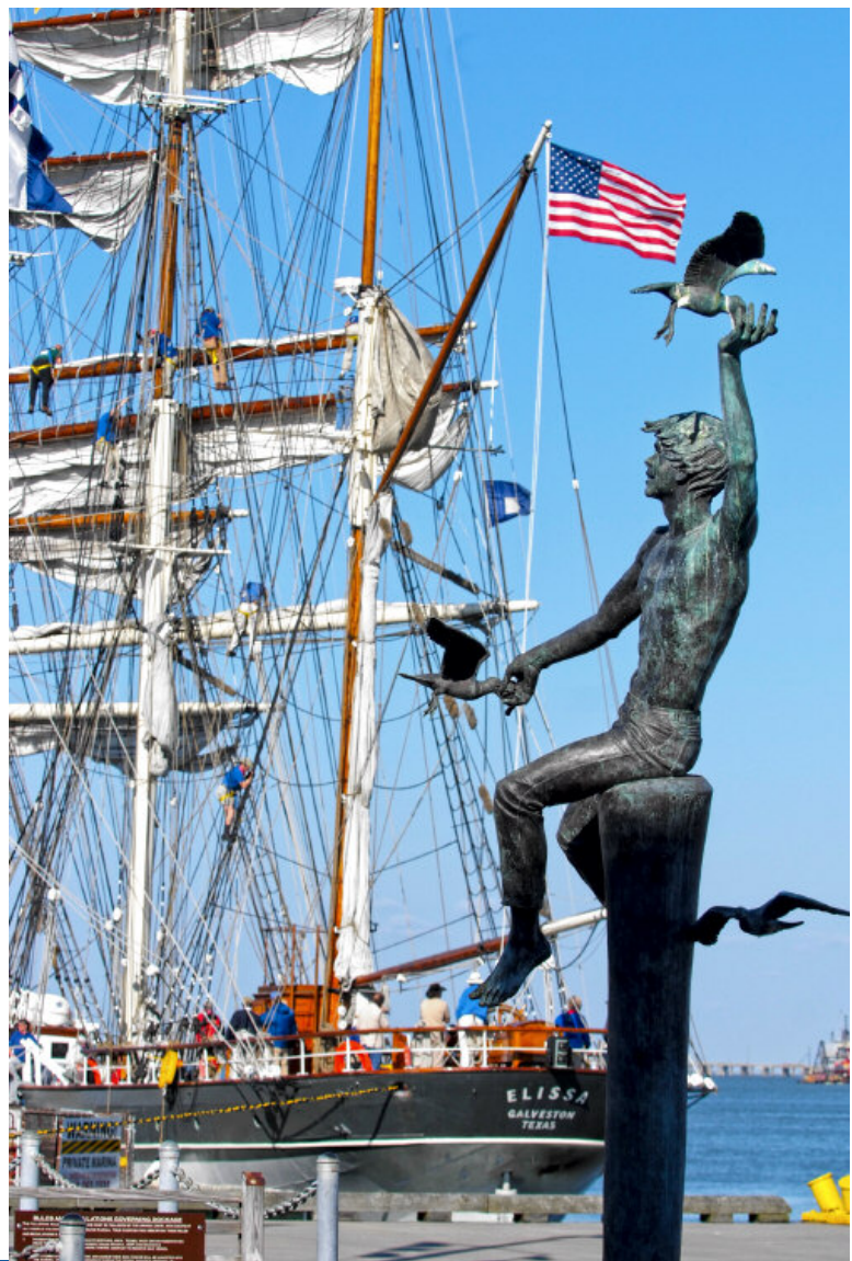
The Galveston Island Historic Pleasure Pier. Galveston is home to several historic ships: the tall ship Elissa.

For more on visiting Galveston, follow the link below. http://www.galveston.com/socialcenter/