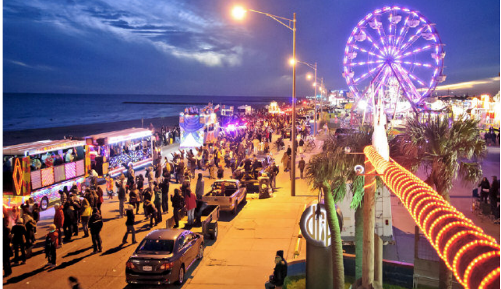
Mardi Gras Beachfront Parade Evening in Galveston.

attraction for the island city. It is the center for two very popular seasonal festivals. It is widely considered the island's shopping and entertainment center.