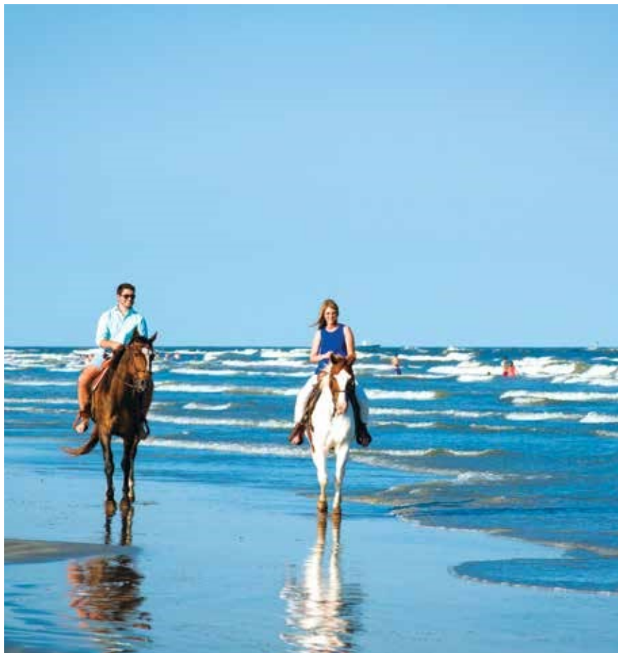
Galveston Beach horseback riding

Sandy beaches, an old-school amusement pier, a state-of-the-art multi-