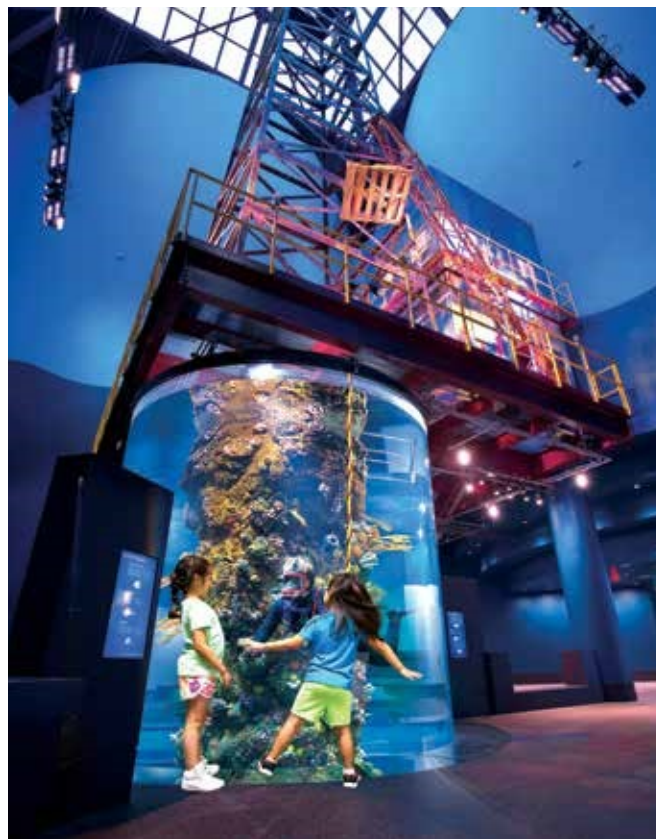
Moody Gardens' Aquarium