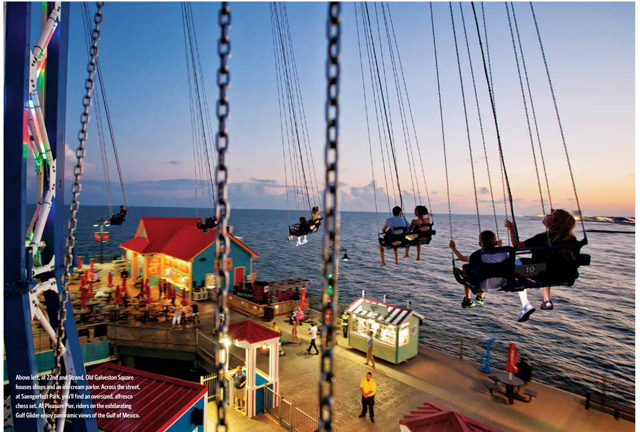
Above left, at 22nd and Strand, Old Galveston Square houses shops and an ice-cream parlor. Across the street, at Saengerfest Park, you'll find an oversized, alfresco chess set. At Pleasure Pier, riders on the exhilarating Gulf Glider enjoy panoramic views of the Gulf of Mexico.

To me, the history of Galveston Island is as alluring as the area's scenic beauty. I love learning about places like the Balinese Room, which attracted celebrities such as Bob Hope and Frank Sinatra in the 1940s; the first International Pageant of Pulchritude of 1926, which drew 150,000 people to the island to witness a bathing-beauty revue; and the nation's longest Pleasure Pier, where sightseers boarded a glittering Ferris wheel to witness panoramic views of the harbor. Galveston, known as the "Playground of the South," had everything: bathhouses, water parks, vaudeville shows, carnivals, and seaside resorts and casinos attracting hundreds of thousands of visitors every year.