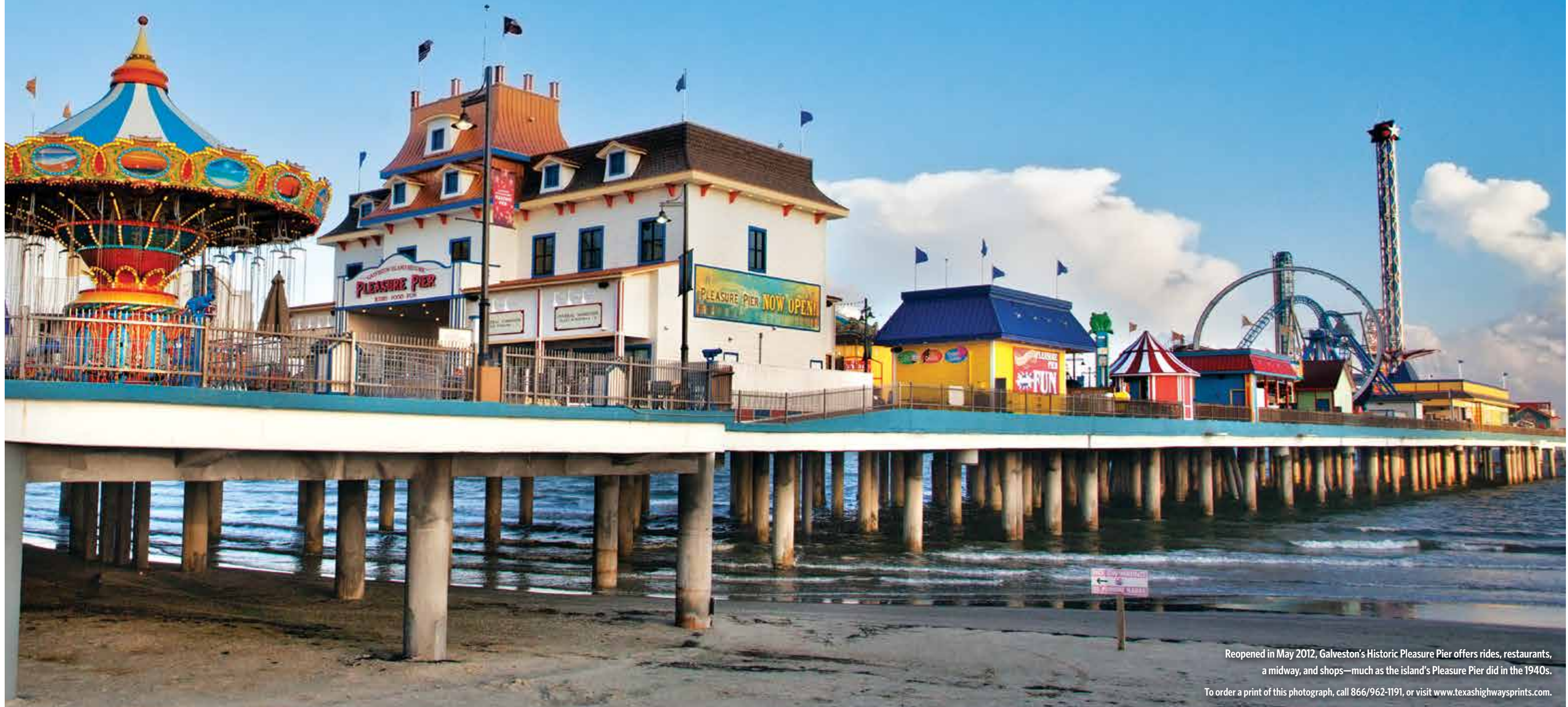
Reopened in May 2012, Galveston's Historic Pleasure Pier offers rides, restaurants, a midway, and shops—much as the island's Pleasure Pier did in the 1940s. To order a print of this photograph, call 866/962-1191, or visit www.texashighwaysprints.com .

Text by Ramona Flume