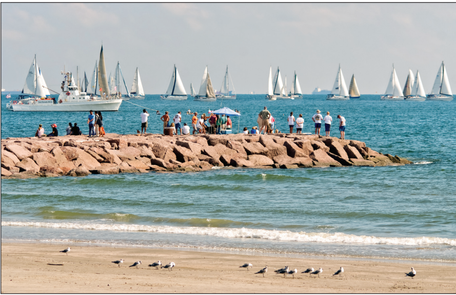
GALVESTON CONVENTION AND VISITOR’S BUREAU

At the east end of the island is Beachtown, filled with contemporary condo rentals, ideal for walking on the beach or nature preserve or kayaking. For dining, Porch Café serves